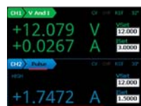
Pulse Current Measurement