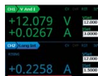
Long Integration Measurement