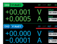
Voltage/ Current setting and Temperature Display