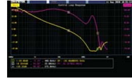
Control Loop Response