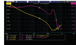
Control Loop Response